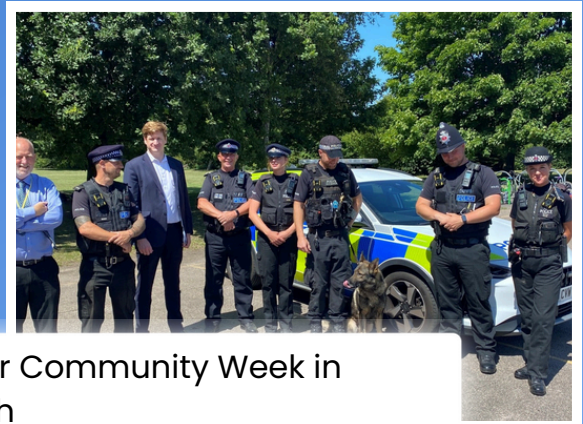
Love Your Community Week in Sandwich