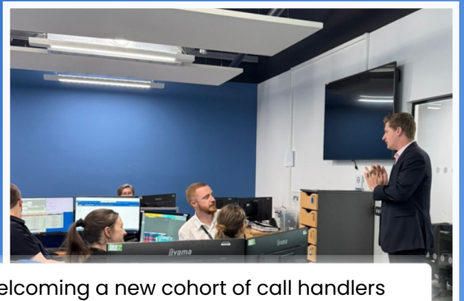
Welcoming a new cohort of call handlers