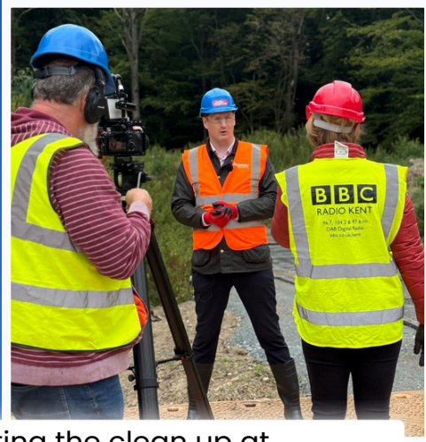
Visiting the clean up at Hoods Wood