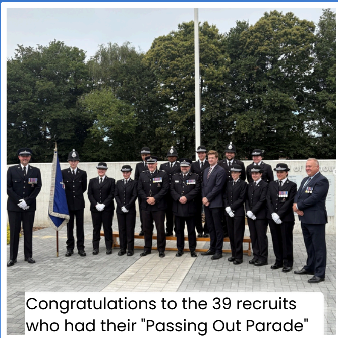
Congratulations to the 39 recruits who had their "Passing Out Parade"